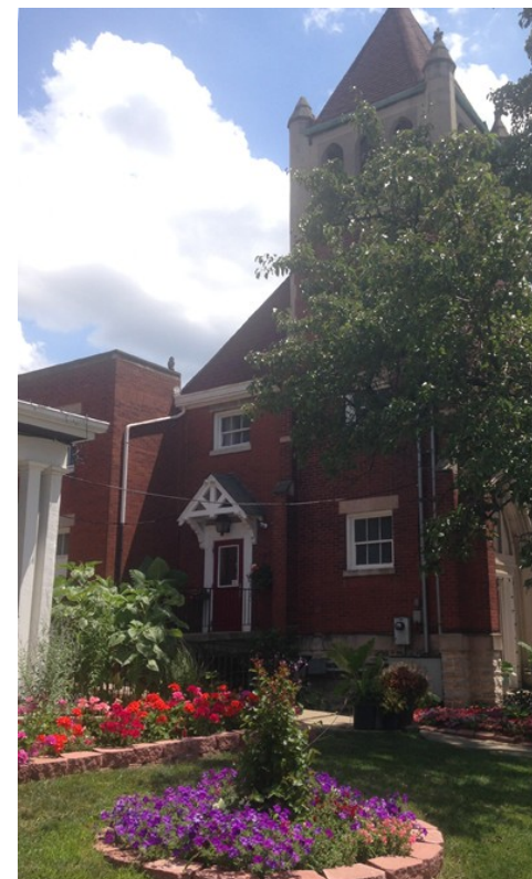
Technological College Preparatory World Academy